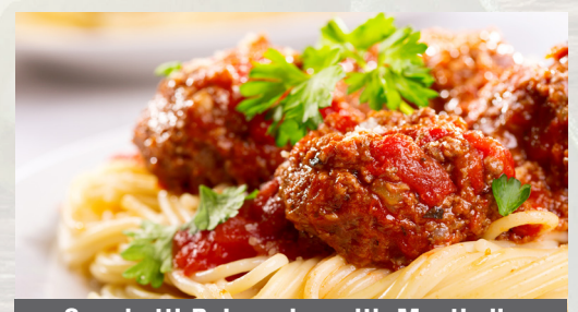
Spaghetti Bolognese with Meatballs

Fettuccine Carbonara 22.99 Cream, butter, bacon, parmesan cheese